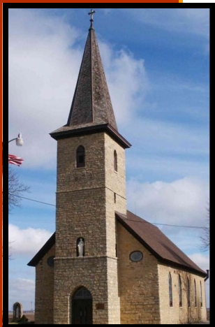
Sts. Peter & Paul Catholic Church

Have you had a vision? Ever had the feeling of excitement in seeing a vision become reality? I am experiencing that awesome feeling of excitement with the ongoing changes and improvements that are occurring in all aspects of the Peterstown TEC program.